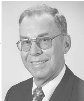
North Carolina State University